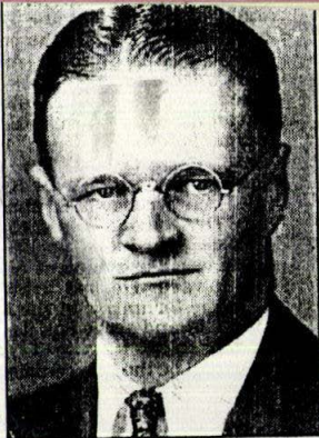
1930 Photo W. SIMMONS TYLER