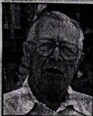
1989 file photo