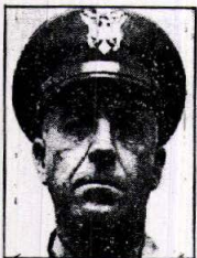
— 1962 file photo

He was born at Fall River, Mass., and graduated from Norwich University in Vermont.