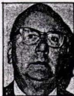
1968 file photo