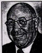
1978 file photo