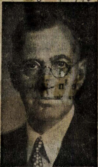
Judge Carroll S. Chaplin

Judge Chaplin was first elected mayor of Portland in 1922, serving four years.